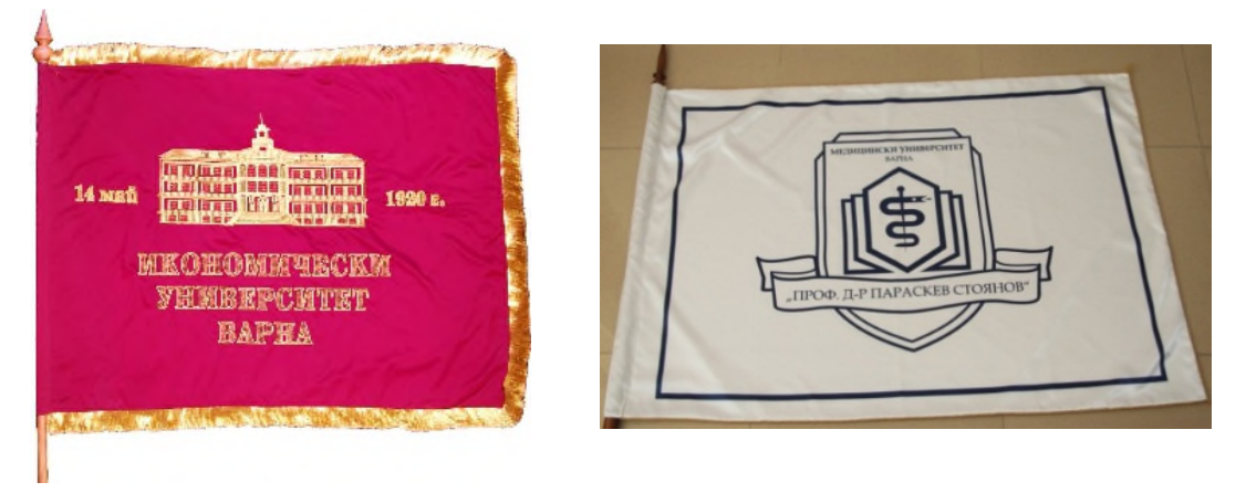
Fig. 7 Official flag from University of Economics - Varna and Medical University-Varna<sup>9</sup>

The flag (fig. 7) is also an important symbol in the academic tradition. The flag of the Medical university – Varna is elaborated out of white silk and tinsel. In conformity with the heraldic tradition on the white background are embroidered the emblem and the name of the institution in blue: Medical university "Prof. Dr. Paraskev Stoyanov". The purpose of the laconic approach is the logo to be maximum readable and distinguishable. The flag is carried in formal and particularly solemn cases. It is necessary for the color printing of the machines to be of high color fidelity to the submitted project ( Лолър, 2006 ).