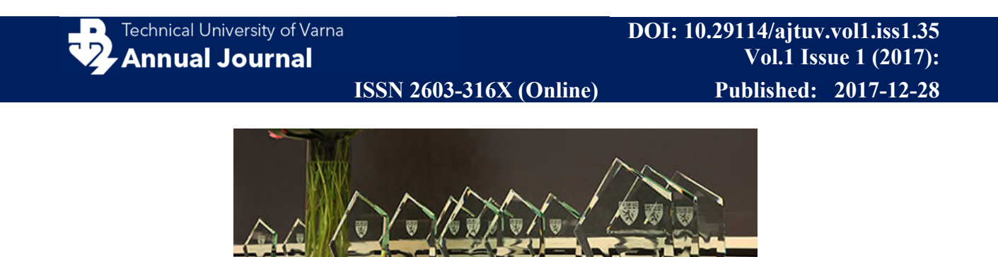
Fig. 10 Prize plaque. University in Harvard <sup>12</sup>

4.3. The academic souvenirs (fig. 11, 12 and 13) are memory for a certain period of the life of each person. The album with photographs of the class and the batch of graduates is always interesting to be opened, to be remembered interesting cases and events. The ring, medallion emphasize affiliations to a certain group, which have graduated at a school or university, famous for its traditions. On the working desk may be put a plaque with the logo of the school/university and the year of graduation/ the batch of graduates.