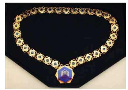
Fig. 4 Updated Rector's necklace from Medical University-Varna<sup>6</sup>

loaded through the idea about the Solomon's knots, as embodiment of wisdom and knowledge as a whole. It is extremely important to review the checklist for submitting files to the subcontractor (Лолър, 2006).