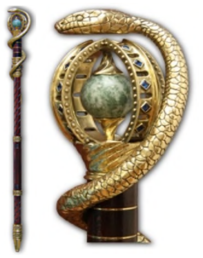
Fig. 6 Previous and modernized Rector's mace from Medical University-Varna<sup>8</sup>