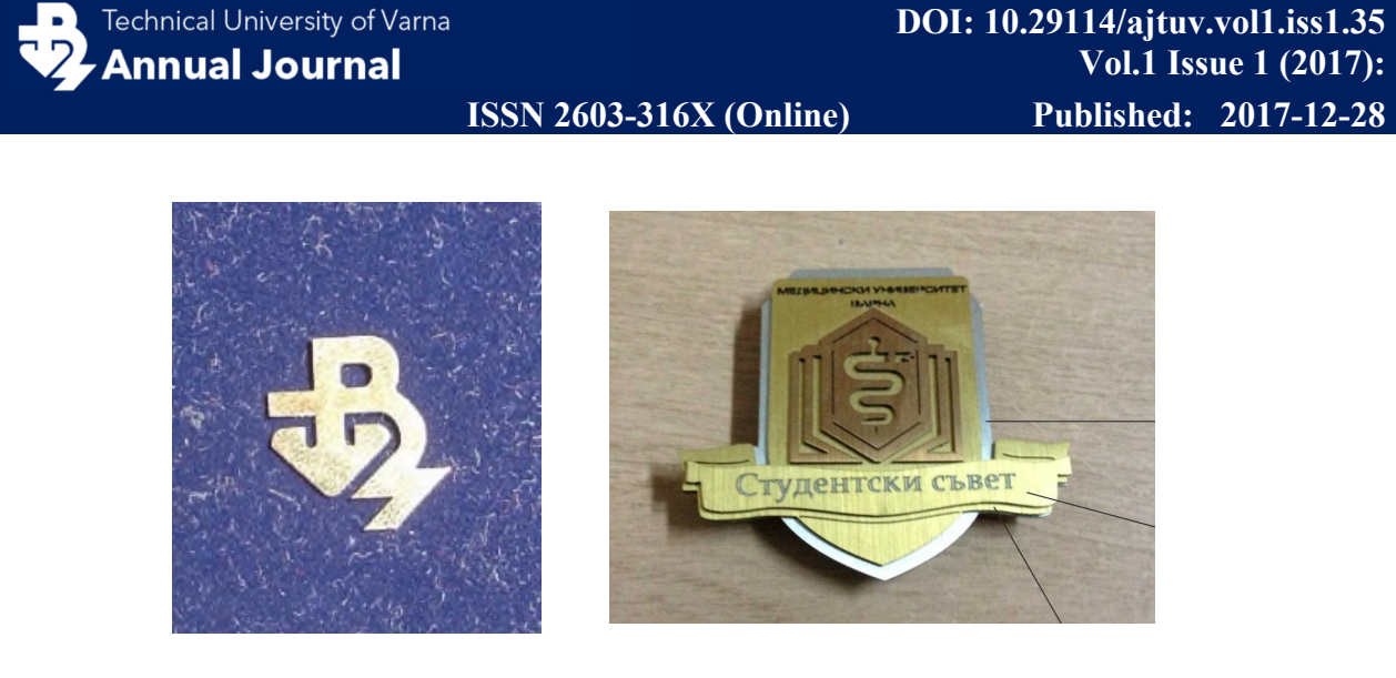
Fig. 8 Badge with a logo from Technical University – Varna and Medical University - Varna<sup>10</sup>

4.2.2. The prize plaque (fig. 9 and 10) can be with full coat of arms by means of several layers of chromium-nickel base, casting, metal, plastic, wood, crystal or other usually with the shape of a circle with an embossed depiction and inscriptions, connected with some event, competition, jubilee, which serves as an honorary sign.