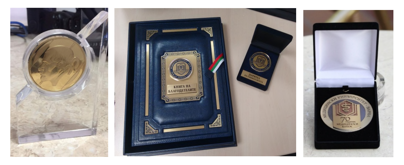
Fig. 9 Prize plaque on the occasion of 55 years Medical University - Varna, Thankful book and plaque and prize plaque on the occasion of 70 years Medical College - Varna<sup>11</sup>

It is put in a luxurious wooden box, allowing its transportation with a view to the visual criteria about style, safety at protection of its integrity. The plaque is with additional elements to the academic regalia in a strengthened strict and individual character, allowing enrichment and diversity towards the concrete event. When designing plaques, it is necessary to take into account the logical and raffic design guidelines. (Макуейд, 2007).