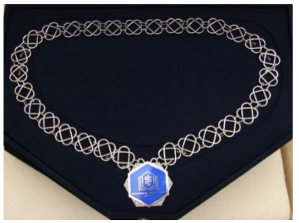
Fig. 5 Updated Dean's necklace from Medical University-Varna <sup>7</sup>

4.1.2.2. The Dean's necklace (fig. 5) repeats the basic forms of the Rector's one, but it emphasizes on the statute through its silver-plated colour, hemstitchness and the additional plasticity of the Solomon's knots, which are forming the necklace.