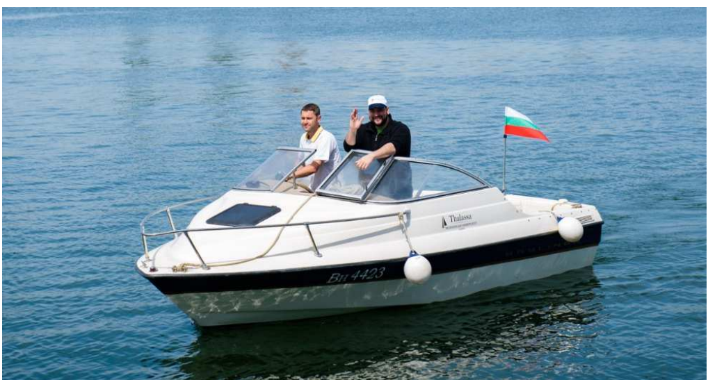
Fig.9. The overall appearance of Panacea and Talassa motorboats.