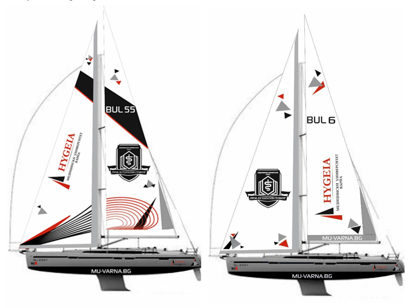
Fig. 8. Variant 5 and 6 / General appearance of the final variant "Hygeia"/.8

There were some triangle elements left that made the appearance of the sailboat effective and full of contrast in the basic colours black and red, adding a complementary grey colour for balance. The sailboat's logo which is characterized by a larger amount of text, is exposed on the main sail and is positioned next to the main mast in such a way that it does not allow deformation of the image as a result of the wind force. The logo of MU-Varna is written in black, white combination was positioned in an appropriate place which allows optimal stretching and spreading across a larger surface area. The reduction of additional details helped towards a greater distinction of the elements and solved the problem with the weight of the sails. The lines and triangles on the hull and the sails of the sailboat were placed with the aim to increase the sports appearance of the yacht, while the overall subdued shades and tones that brought light were projected in such a way that they enhanced the elegant and dynamic design. (Fig. 8).