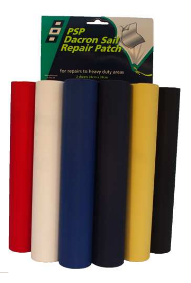
Fig. 6. Materials used in branding. <sup>6</sup>

It was established that the necessity for strength of the elements on the sails limited the choice of materials to a great extent. The most appropriate material was considered to be "insignia" advertising or promotional material. It endures the constant changes in weather conditions ( Mapxaŭ , 1988) and they add to the durability of the sail (Fig. 7). The material used though can lead to unnecessary thickening / at places, where the appearance needs arranging in layers/ and is offered in a limited choice of colours which additionally influenced the choice of the final brand variant. As a result of the combination and specificity of requirements on the one hand and the technical characteristics of the materials used, the necessary appearance of the sailing boat was attained.