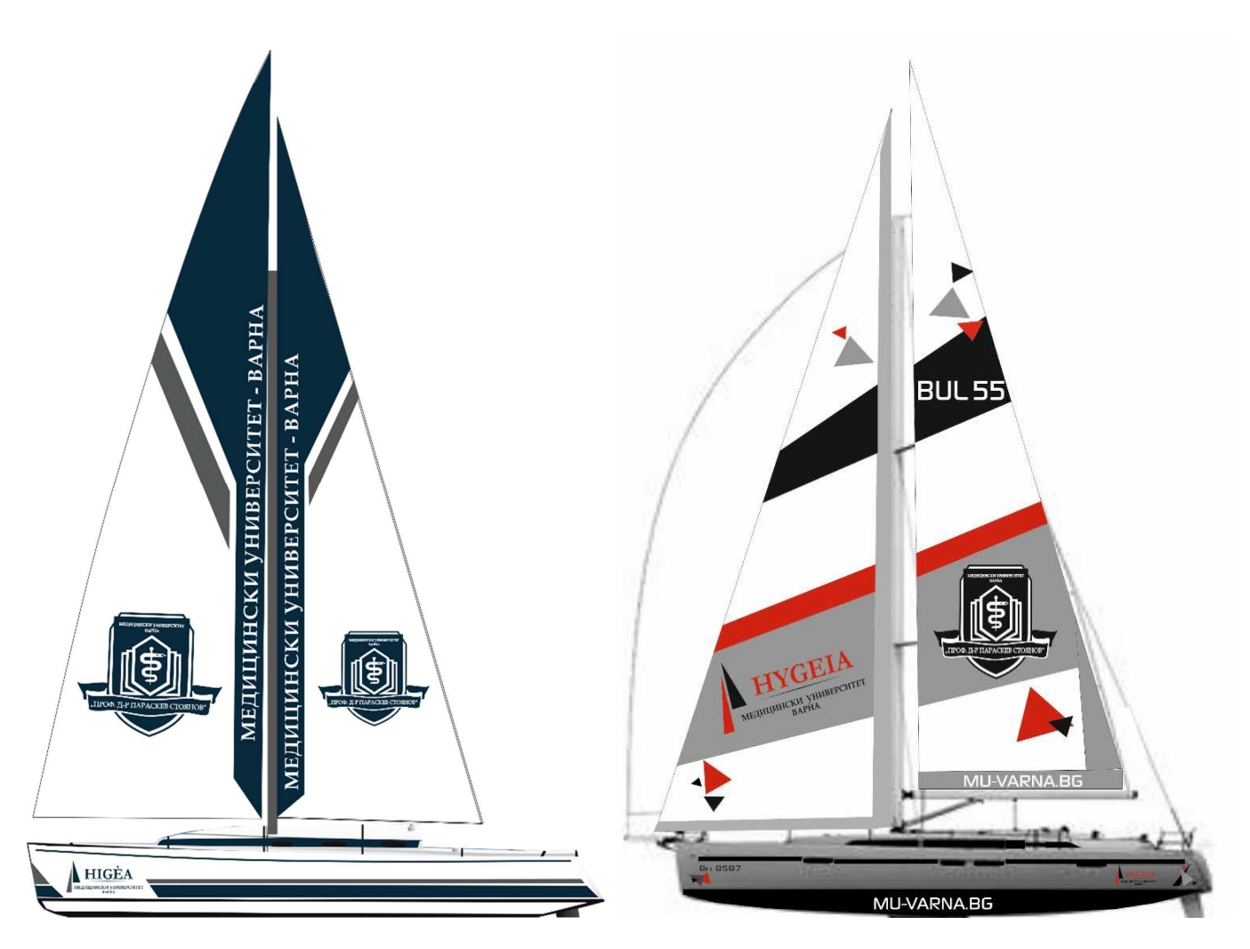
Fig. 5. Variant 3 and 4.5

Variant 4 (Fig. 5)— This variant meets most of the criteria. Both necessary logos are used and each one of them is placed on a separate sail. The red and black colours introduced, improve the contrast and efficacy of the elements. Some principles of optical decomposition have been applied here. They are based on some disguised patterns following geometrical principles (Taчeb, 2015). Unfortunately, it was established that the surface area of this variant did not allow good enough positioning of the details because of the specific shape of the sails in different wind strength.