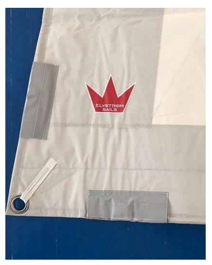
Fig. 7. Part of Variant 6 conclusive (final).<sup>7</sup>